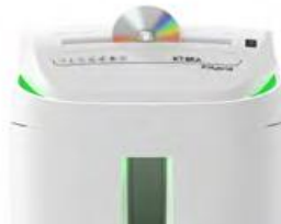
240 mm ENTRY THROAT